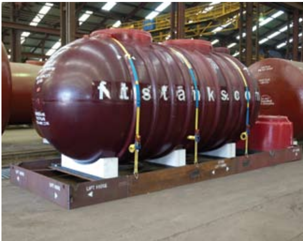
20,000 litre Dual Compartment Fuel Tank on Pallet For Export