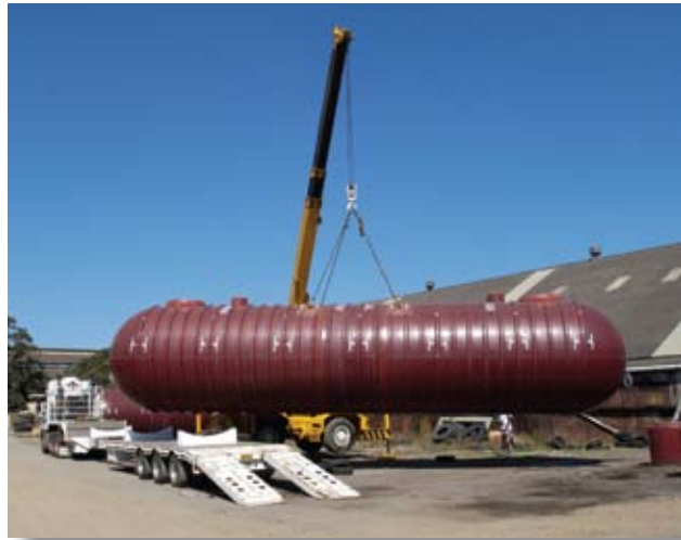
110,000 litre Dual Compartment Fuel Tank