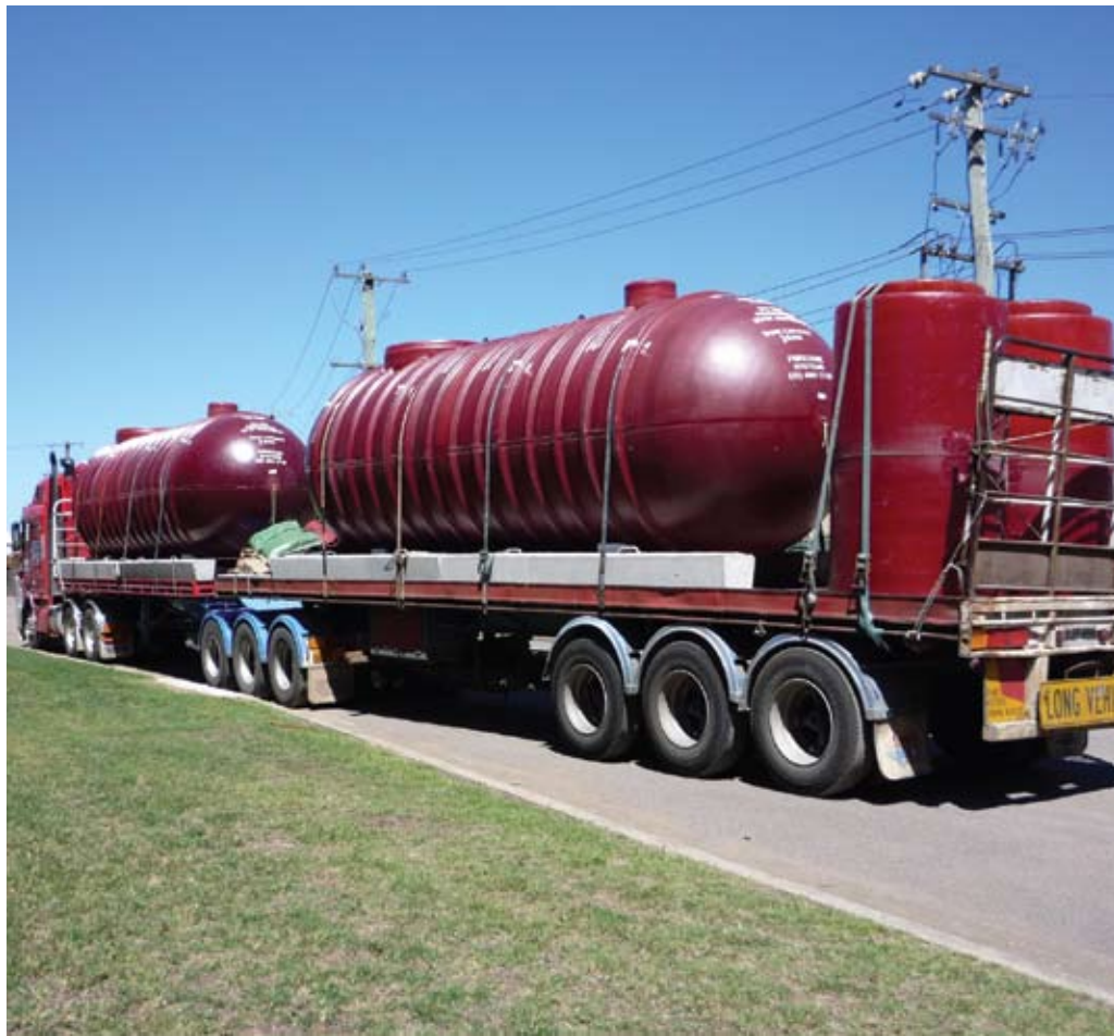
30,000 Single Compartment Underground Fuel Tank

FTS are leaders in the manufacture of Fibreglass Underground Tanks.