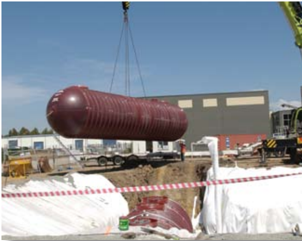
55,000 litre Single & Dual Compartment Fuel Tanks